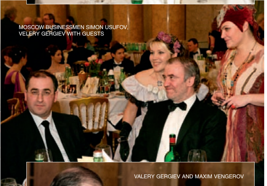
MOSCOW BUSINESSMEN SIMON USUFOV, VELERY GERGIEV WITH GUESTS