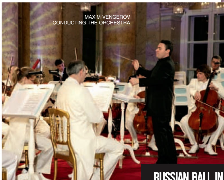
MAXIM VENGEROV CONDUCTING THE ORCHESTRA