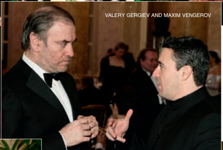
VALERY GERGIEV AND MAXIM VENGEROV