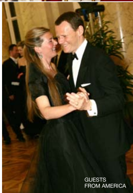
GUESTS FROM AMERICA